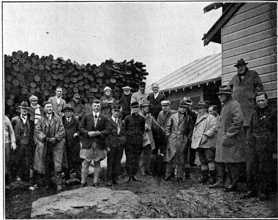
THE OFFICIAL PARTY AT THE OPENING.