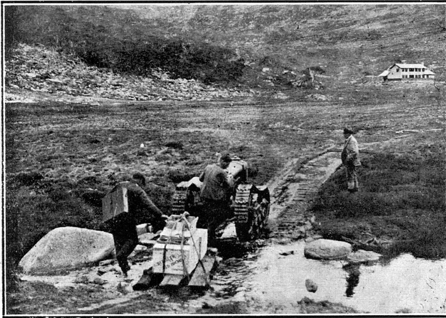
TAKING PROVISIONS TO THE CHALET.

Sleeping in a dormitory was a new experience for some of the visitors, but great comfort was provided. The heat at night did not diminish, and, instead of having to get up to throw more logs on the fire in order to prevent immediate dissolution from frost, as was the need in old Betts Camp days, blankets were tossed off the beds in endeavors to cool down.